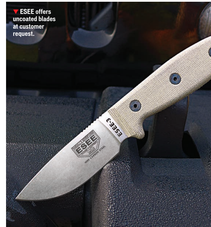
▼ ESEE offers uncoated blades at customer request.