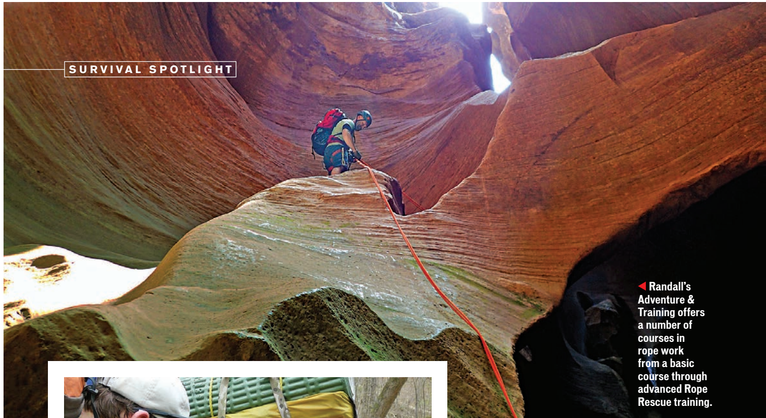
◀ Randall's Adventure & Training offers a number of courses in rope work from a basic course through advanced Rope Rescue training.