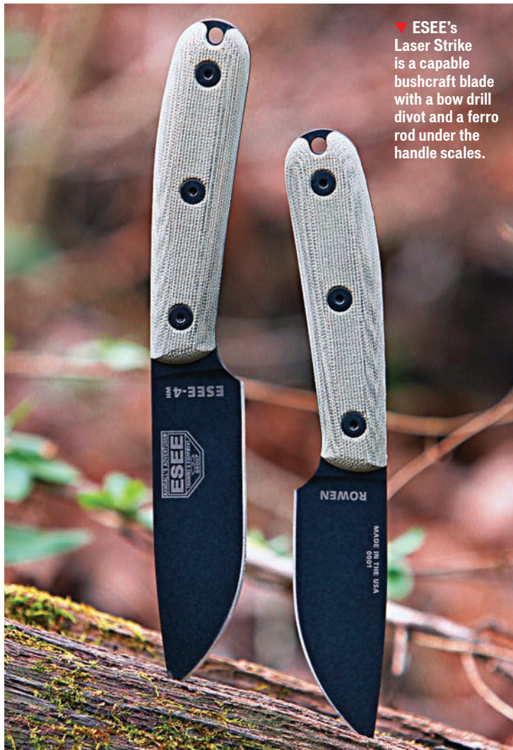
▼ ESEE's Laser Strike is a capable bushcraft blade with a bow drill divot and a ferro rod under the handle scales.