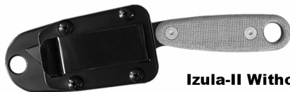
Izula-II Without Kit

If you purchased the IZULA-II® (without kit), the package includes: IZULA-II® knife, molded sheath and clip plate.