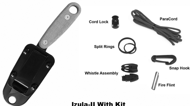
Izula-II With Kit

If you purchased the IZULA-II® with kit, your package includes: IZULA-II® Knife, Molded Sheath, ParaCord, Split Rings, Ferro Fire Starting Rod, Emergency Whistle, Snap Hook, Clip Plate & Hardware. See right side of this page for uses.