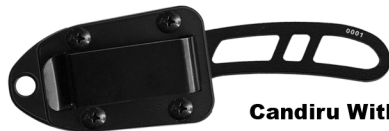
Candiru Without Kit

If you purchased the CANDIRU® (without kit), the package includes: CANDIRU® knife, molded sheath and clip plate. The standard CANDIRU® does not include Micarta handle scales (optional purchase through our dealer network).