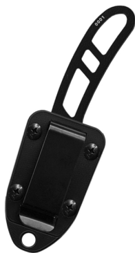
Candiru With Kit

If you purchased the CANDIRU® with kit, your package includes: CANDIRU® Knife, Molded Sheath, ParaCord, Split Rings, Ferro Fire Starting Rod, Emergency Whistle, Snap Hook, Clip Plate & Hardware. See right side of this page for uses.